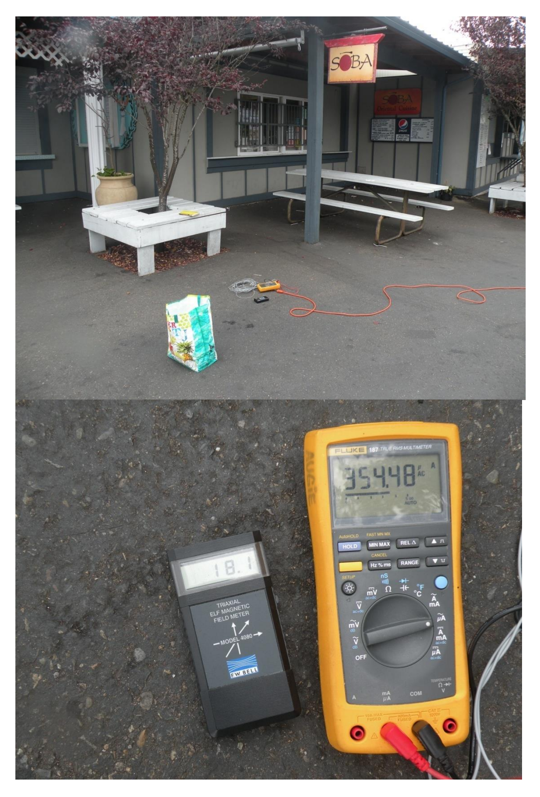
Figure 1 Magnetic field on pavement and body amperage