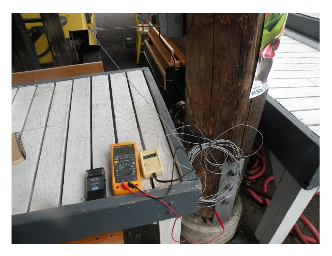
Figure 2 Amperage between outlet ground and metal support

The amperage measured between an outlet ground and the metal corner support at the east end of the market at the produce stand was 3,354.8 uA with the market closed on 7/22/ 2015. Magnetic field was 0.2 mG and dirty electricity measured 3,240 units.